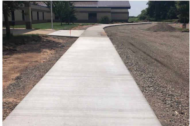
Concrete sidewalk complete at front of MES