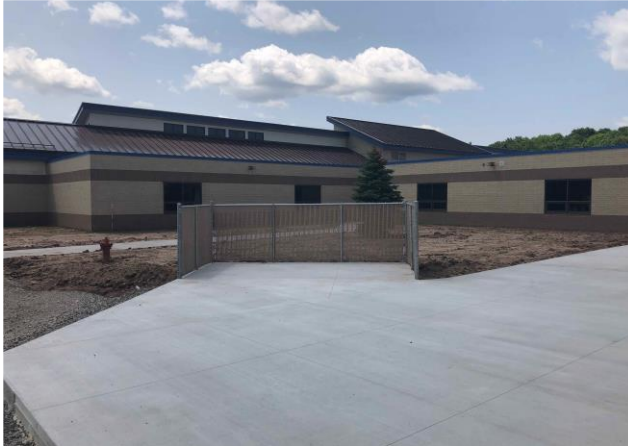
New dumpster enclosure at MES