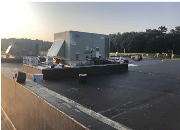
Roof replacement LWJSHS